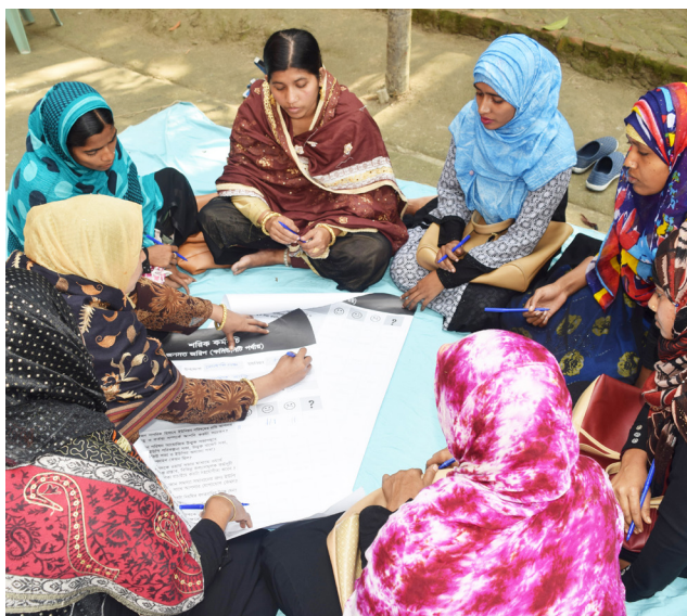
Open budget meeting.