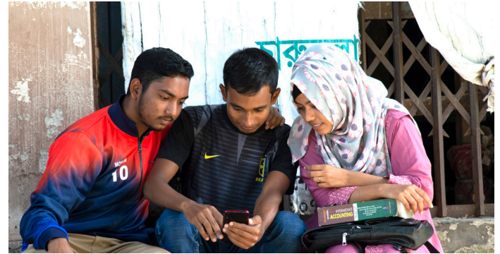
Sharing knowledge on social media.

Helvetas has developed a set of approaches to work intergenerationally, cross-culturally and across faiths with young people to address the root causes that prevents them to thrive. We acknowledge that "youth" is not a homogeneous group, and that their lived experiences differ, based on gender, cultural background, ethnicity, education, employment status, rural or urban context, etc. Our Youth Taskforce supports young people in becoming positive change agents through innovation and networking.